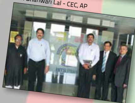
Shri Bhanwari Lal - CEC, AP