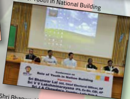
Shri Bhanwari Lal - CEC, AP